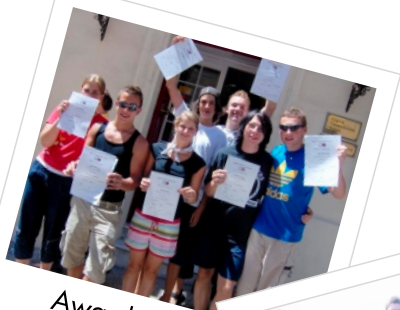
Award in front of school