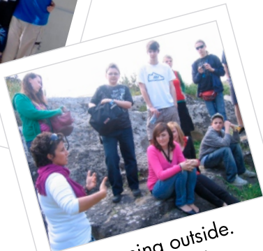
learning outside. Countryside