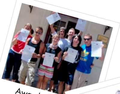
Award in front of school