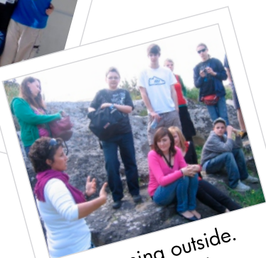
learning outside. Countryside

E CS offers teachers or group organisers the possibility to request a tailor made programme based on 1 or 2 weeks and choose from the following: