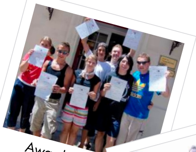
Award in front of school