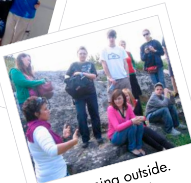
learning outside. Countryside