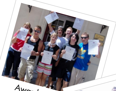
Award in front of school