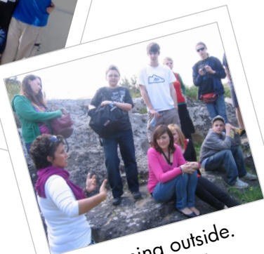
learning outside. Countryside

Airport transfers to Accommodation and Accommodation to airport.