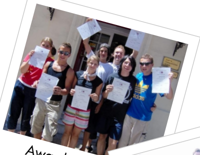
Award in front of school